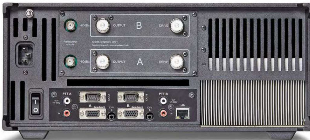
Figure 2 — The PGXL rear panel. RF input and output and predistortion sampler connections are in the upper center, with band data/CAT and PTT connections below.

ceivers, connect the PTT control to the appropriate PTT phono connector. Connect the transceiver CAT cable to the appropriate amplifier DB-9 CAT connector (optional if you plan to use RF sensing). That's it.